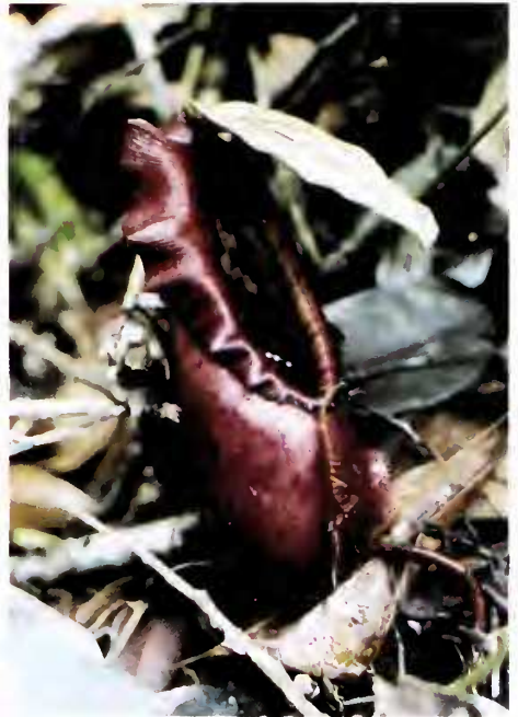
N. northiana lower pitcher